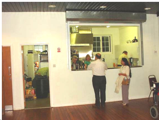
The Pumpkin Room

A flexible room for smaller meetings or parties which can also be used as a bar/food servery for bigger events. This room can accommodate up to 120 people, or 40 people seated.