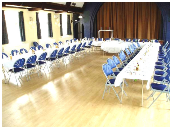
The Straw Plaiters Hall

A large, attractive, well-lit room with a stage and a fully sprung dance floor which can accommodate up to 120 people seated and 200 for discos etc.